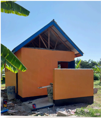
ABCD UK Project

ABCDreams UK launched in 2013 with a program to support primary school pupils with their school fees; we are now supporting these same pupils in secondary school!