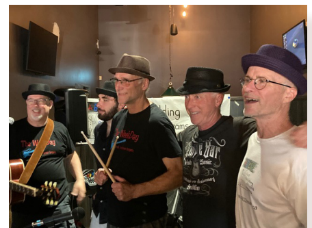
The Weekday Band