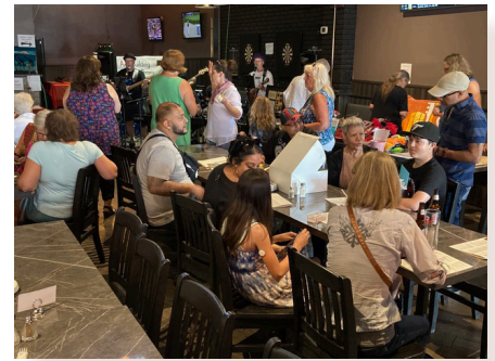
June Music Fundraiser Event