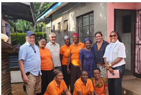
Meeting ABCD Care Mamas Group

The original 5 women that formed CARE ABCD Tanzania in 2018 has grown to include 10 women and 2 volunteers. The original plan in 2018 was to sell personal care kits to young girls and their mothers in Marangu West ward of Kilimanjaro Region to manage their menstrual cycle with dignity and in improved health. Today, along with personal health information, this dedicated group of mamas are providing each girl entering Form 1 at two