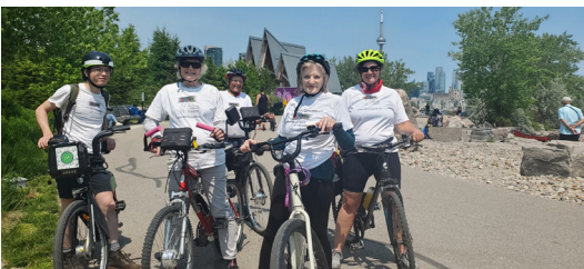
Dream Peddlers at the CAP Ride

In early June, the Dream Peddlers took to the streets of the Greater Toronto Area to raise money for ABCD as part of the Canada Africa Partnership (CAP) Ride.