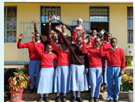
Meeting Secondary School Students

It was a very productive and rewarding trip. Plans for future operations were discussed and there was a very valuable renewal of relationships.