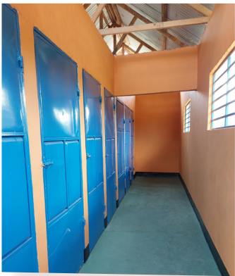
ABCD UK Project