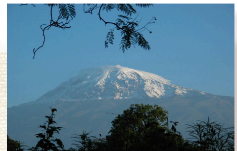
Mount Kilimanjaro, Tanzania

Overall, the general cultural situation in Tanzania is positive and hopeful of a brighter future and it is hoped that current president 'Mama' Samia will continue her commitment to development.