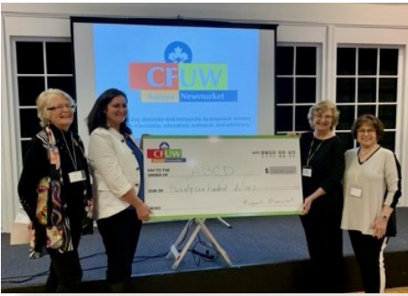
CFUW donation to ABCD