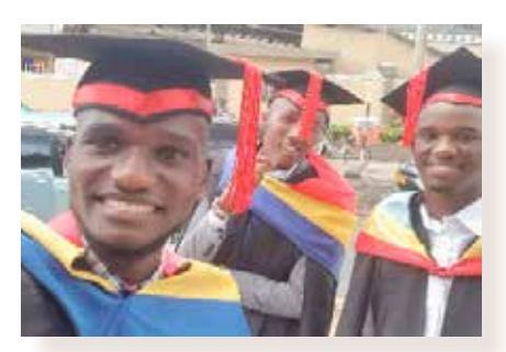
Audifas on graduation day

We congratulate them and look forward to more good news from Tanzania as we hear that the economy is improving!