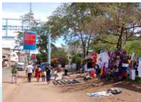
The gig economy of Tanzania

ABCD is proud to welcome 25 aspiring doctors, engineers and teachers who are well deserving of our support. We were anticipating adding only 12 children, however we were so moved by all applicants' stories and drawings, that we added them all. Would you consider taking on the support of one of these needy children? See their artwork and be inspired by their stories here: https://www.abcdreams.ca/index-of-children/