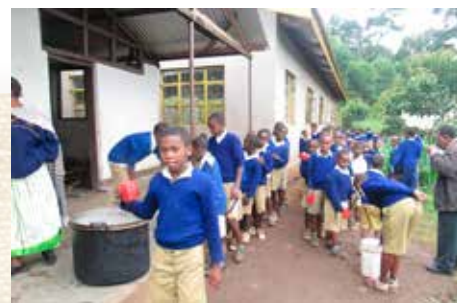
Full tummies and sharp minds

Just for the experience, I've served the breakfast myself when on volunteer trips and it's certainly a special time of smiles and chatter as children gather around enjoying breakfast.