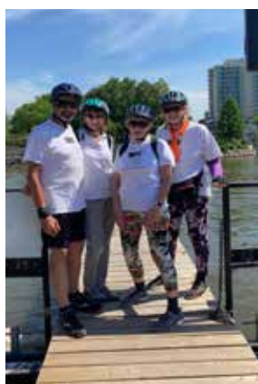
A Group at Port Credit

The annual CAP ride took place in June and it was a wonderful success for ABCDreams! We would thank all those folks who supported us in our fundraising ride. From the bottom of our hearts... THANK YOU!