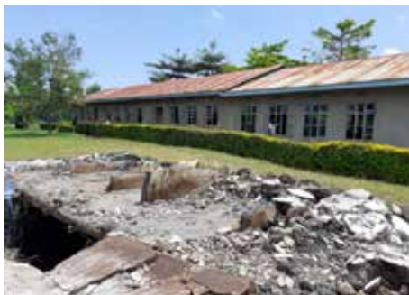
Urgent need for new toilets