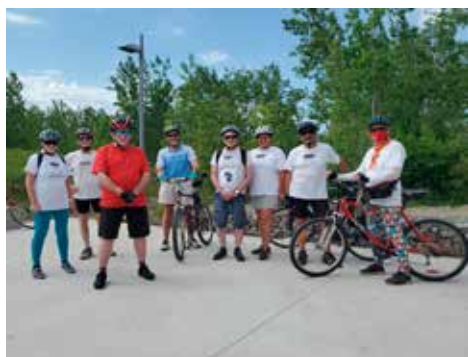
A Group at start of Leslie St Spit