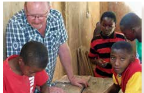
Terry shows how to make solar lights