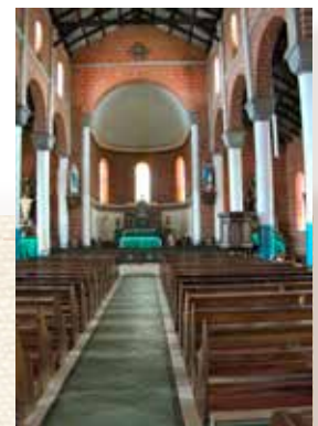
Empty Makomu church doesn't stop "hard prayer"

The President of Tanzania has asked all Tanzanian citizens to "pray hard". It looks like this pandemic has brought the entire world together to fight this battle.