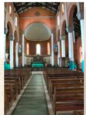
Empty Makomu church doesn't stop "hard prayer"

The President of Tanzania has asked all Tanzanian citizens to "pray hard". It looks like this pandemic has brought the entire world together to fight this battle.