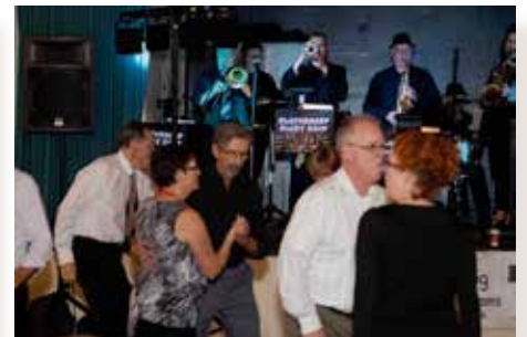
Dancing up a Storm