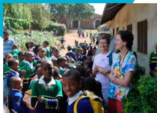
Trip Volunteers at the School