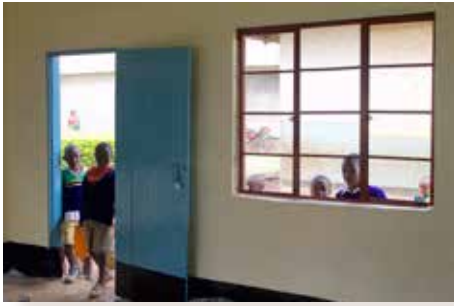
Little ones look at their classroom