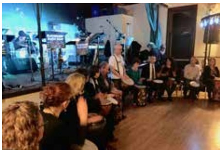
Popular Drum Circle

This event moved from activity to activity seamlessly, casual but on schedule. I couldn't stop talking about what a great event this was – I'm already looking forward to the next one!