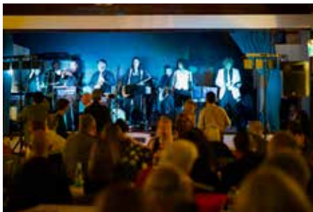
Backboard Blues Band