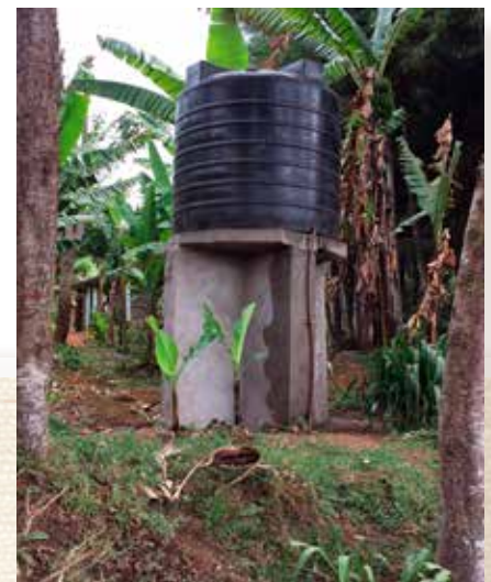
Crowd Funding Water Tank

Supporting us through sharing our common passion can go just as far as monetary support, so we'd like to thank you in advance for taking a moment to share your passion with others! Thank you!