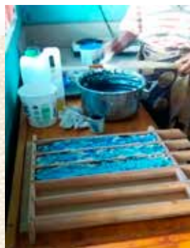
Care ABCD Soap Making