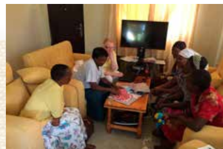
Planning the start of Care ABCD Tanzania