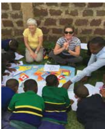
Teaching about Canada