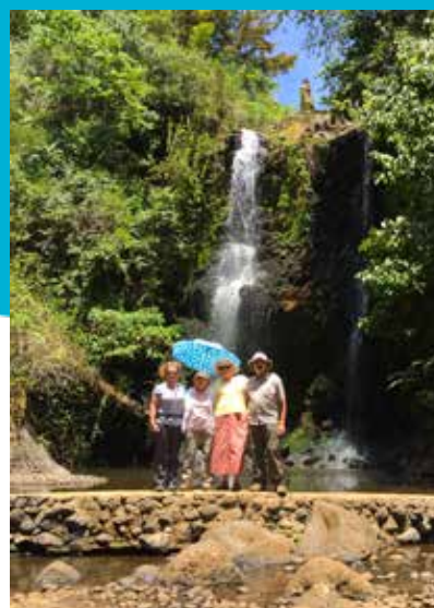
Volunteer Team at Local Waterfall