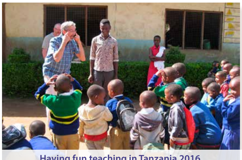
Having fun teaching in Tanzania 2016

You can assist with ABCD projects, teach in a primary school, meet sponsored children, learn about life in Tanzania, visit local markets, go on safari or climb Mount Kilimanjaro. Contact us at info@abcdreams.ca for information.