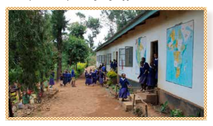
Crowd Funding at a glance