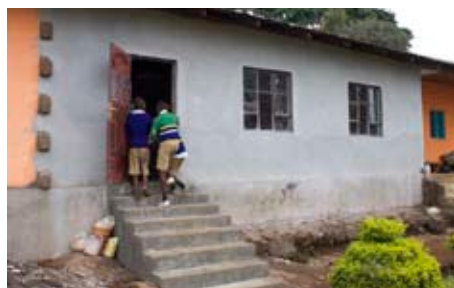
Into their library