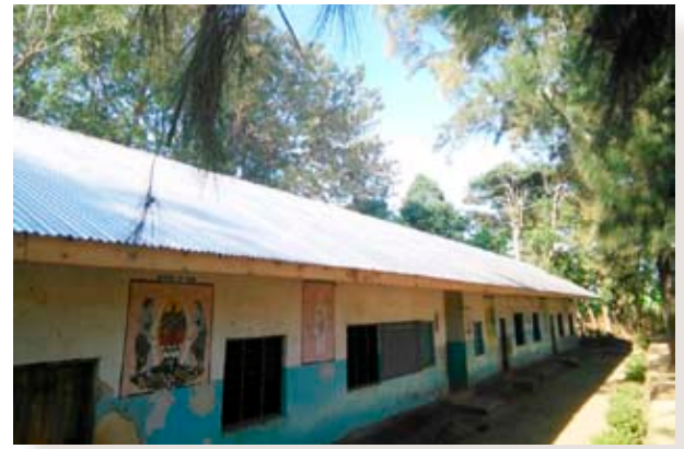
Kiunguni/Komalyangoe PS roof completed

A new roof at Kiunguni/Komalyango'e PS will be a welcoming sight for both teachers & students. No more sitting under a leaky roof there!