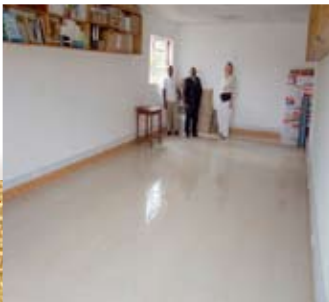
New computer room and library

This is a special appeal to our supporters to send in a cheque for ABCD to put towards the post-secondary fees for these students. On average, fees and boarding costs for one student's post-secondary year are around $2500. This year, 11 ABCD students need this support. Any amount that you can give is very much needed and welcomed.