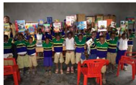
Happy with their books

This year ABCD funded a primary school library at Kitowo/Napaku Primary School giving 450 more students in Marangu West access to additional text books and general reading material. This is our fifth primary school library and plans are in progress to add more. We were pleased to see the formation of a student library club Makomu/Kyala PS. They are an enthusiastic group of students who will keep the library well organized and enjoyed.