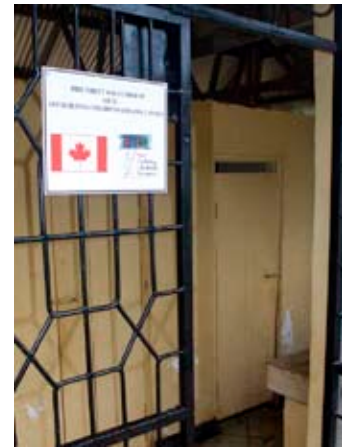
Kitowo/Napaku PS toilet sign