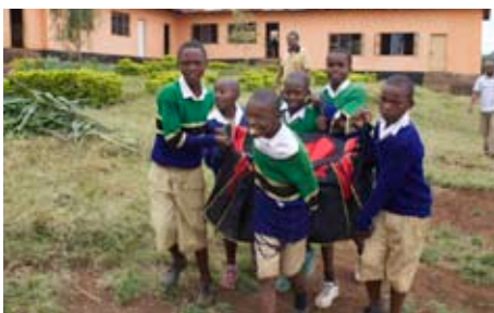
Kitowo/Napaku PS book delivery