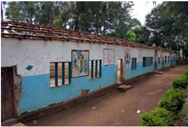
Kiunguni/Komalyangoe PS old roof is off