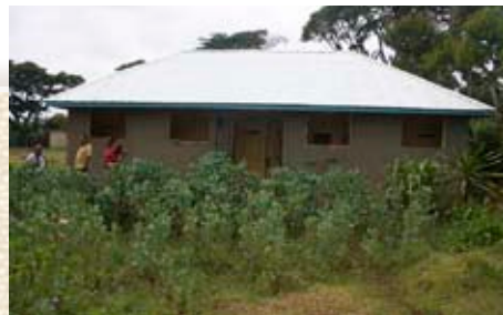
Kitowo/Napaku PS new toilet block