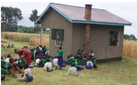
New Kitchen at Kitowo/Napaku

Any mention of school kitchens must include a mention of ABCDs breakfast programs which continue to feed approximately 4,000 students. What do the students think of their breakfast? “Mmm Mmm Good!”