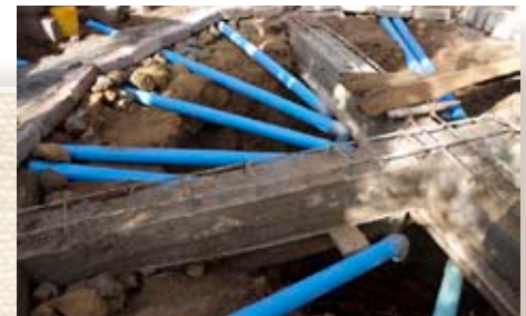
Makomu SS toilet plumbing