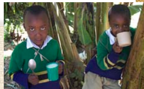
Friends enjoying breakfast