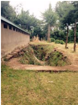
Komela PS toilet repair project