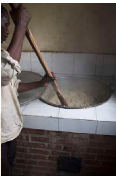
Cook preparing breakfast