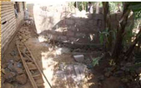
Makomu SS toilet underway