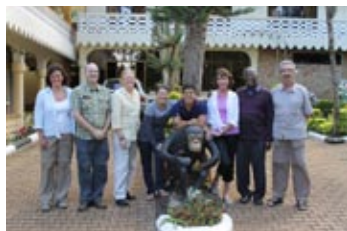
Improvements group at Sekao