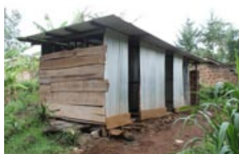
Komela PS toilets

ABCD is committed to continuing its work to improve the learning environment for the students and teachers of Marangu West. In addition to the completed toilet at Makomu Kindergarten, the completed kitchen at Kiunguni/Komalyangoe PS and the new roof at Makomu PS, ABCD has repaired the toilet at Nduweni PS, and the new kitchen is almost completed at Komela PS!