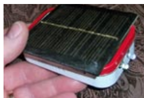
Solar reading light – made from discarded solar garden light and a cough-drop tin