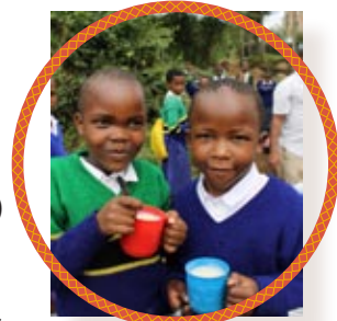
Kiunguni Komalyangoo Primary School