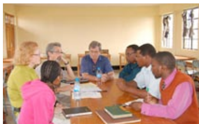
Makomu Planning Meeting

The excitement of the students is mounting and they can't wait to get their fingers moving on the keyboards!