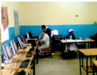
Ngaruma Computer Room