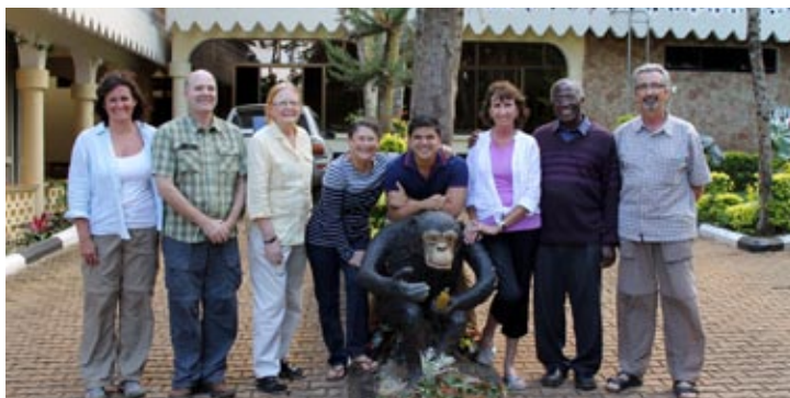
Group in Tanzania

Many other highlights characterized the overall experience of the volunteers. These included: hiking down a steep gorge to see beautiful Kilasila waterfalls, learning to speak survival Swahili, shopping in local markets, Art Day excitement connecting with all the ABCD families and children, going on safari and hiking part way up Mount Kilimanjaro. Lynn and I extend immense gratitude, on behalf of the local community, to this amazing group of volunteers for improving the children's learning environment.