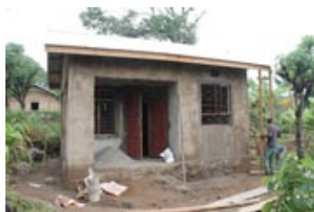
Komela kitchen almost done