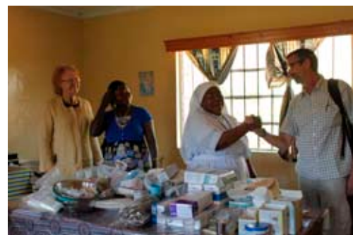
Donating Medical Supplies

many of our families at the ABCD Art Day which was full of friendship, fun, music, theatre and art.