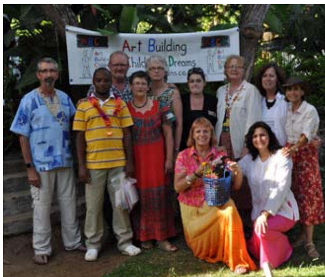
ABCD Team 2012

After the volunteer team went home, the ABCD Directors stayed on to pay for the school fees/supplies/uniforms for all of our children. We also added several new and needy children to the program. We coordinated some plumbing repairs and delivery of supplies to a local medical dispensary. We signed an agreement for ABCD funding of a computer centre at Ngaruma Vocational Training Centre. We also welcomed 4 invaluable local Advisory Board Members to the ABCD Board. A third primary school was added to the ABCD Breakfast Program bringing the total children now being fed breakfast by ABCD to well over 1000! All in all, this trip was a huge success...so much accomplished with so little money, much support from the local community, and a whole lot of giving from the heart by our volunteers. ABCD has truly developed a strong bond of friendship, collaboration and mutual respect within the local community.