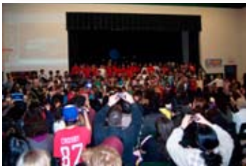
Concert at Castlebridge P.S.

I love working with students at elementary schools to help them create great benefit concerts for ABCD. The concerts consist of students performing my original songs. Each song can have an accompanying dance or drama, and all songs can have a character education theme. The evenings are always a resounding success with the school's communities. Not only do the children sing about helping others, their performances usually raise substantial sums for ABCD children. Concerts were recently held at Light of Christ Elementary School in Aurora, Denne PS in Newmarket and Castlebridge PS in Mississauga. Way to go kids!