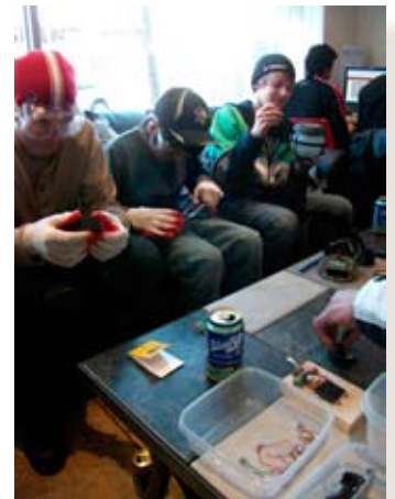
Solar students Canada

It's hoped that as ABCD students in Tanzania develop their skills at assembling solar reading lights, the collection of discarded solar lights in Canada can be expanded.