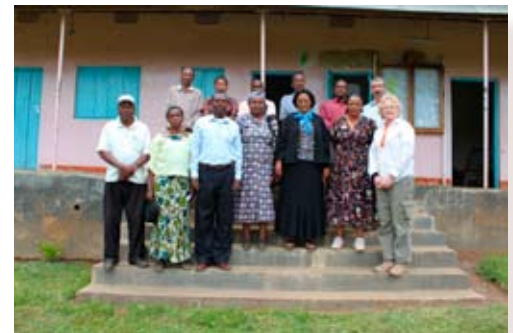
ABCD Marangu West and ABCD Canada

We can happily report that many of the children are improving in school and in their general well being. It was heartwarmingly clear to us that ABCD has become a trusted member of the community, and that this has resulted in children who are both happier and improving in their academic performance.