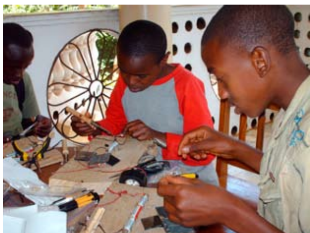
Solar students Africa