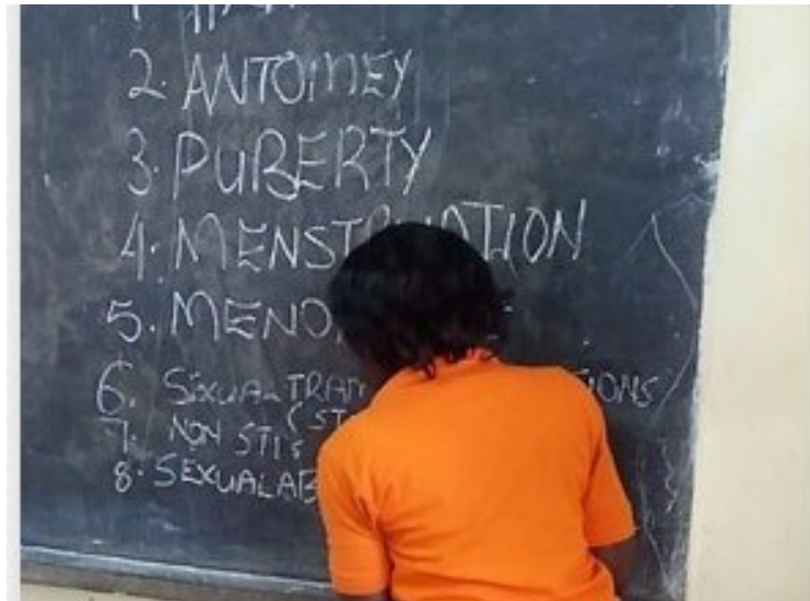
Instruction on pelvic health and use of personal care kits