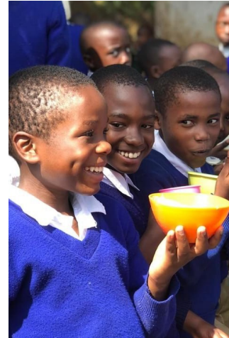
Children enjoying breakfast at Makomu Primary School