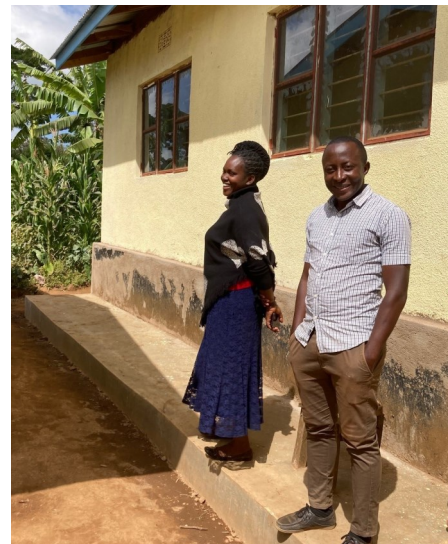
Classroom Repairs at Kitowo Napaku Primary School