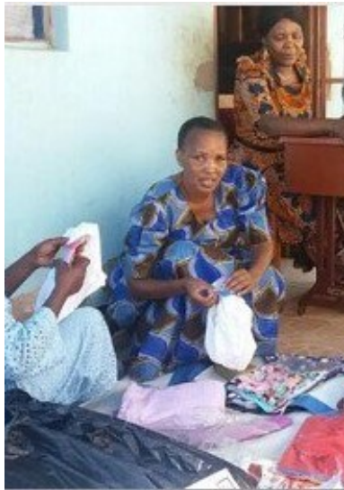
Sewing reusable menstrual pads