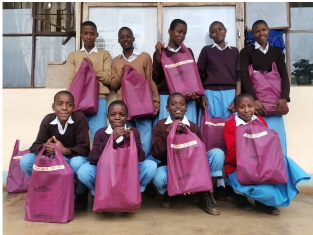
Students receiving school supplies